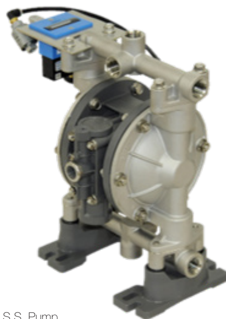
½" S.S. Pump. Pneumatic Stroke Counter Kit. Max Flow Rate: 16 GPM